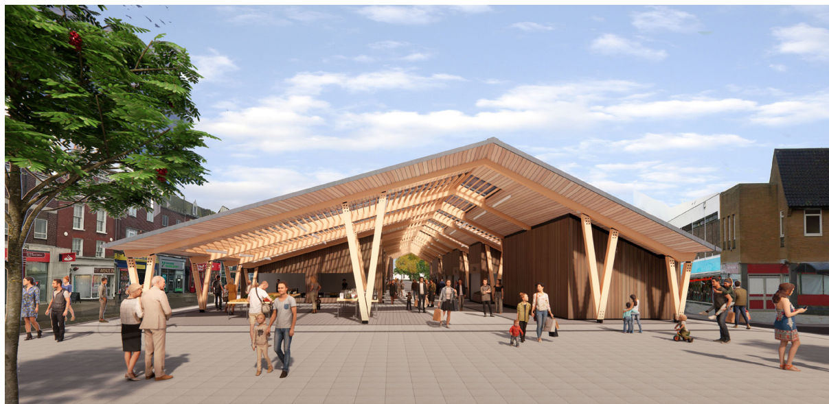
The vision includes a reinvigorated town centre with a redeveloped Market Place at its heart